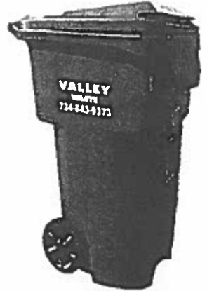
Blue Cart Recycling

Recyclables must be placed loose in carts or bins. Recyclables in plastic bags will not be accepted.