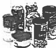
All Metal beverage and food Containers*