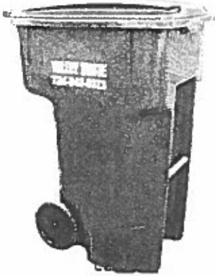
Gray Cart Solid Waste