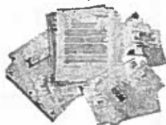
Office Paper/Junk Mail

All Glass, Magazines & Catalogs are not acceptable materials