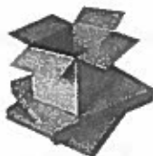
Clean Corrugated Cardboard