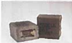
FISHMEAL POLYMER-BASED BAIT CONTAINING VACCINE

Raccoon rabies is found throughout Pennsylvania. It is a viral infection that can affect the nervous system of any mammal, including humans. The disease is almost always fatal to both people and animals. Raccoon rabies spreads rapidly and infects large numbers of raccoons. The disease often spreads to other wildlife and pets, making human exposure a real concern. To address this problem, federal, state and county agencies are participating in a combined program, to keep this animal epidemic from spreading further westward by attempting to eliminate or at least greatly reduce raccoon rabies in western Pennsylvania counties.